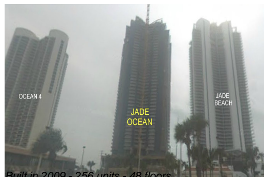
Built in 2009 - 256 units - 48 floors