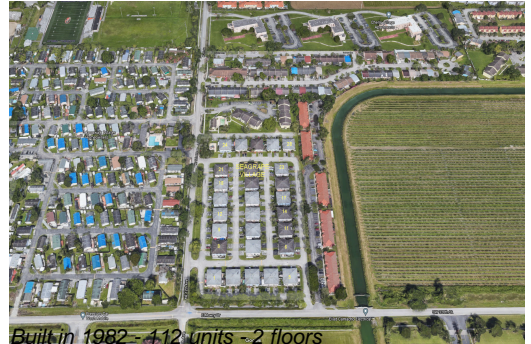
Built in 1982 - 412 units - 2 floors