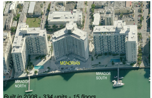
Built in 2008 - 334 units - 15 floors