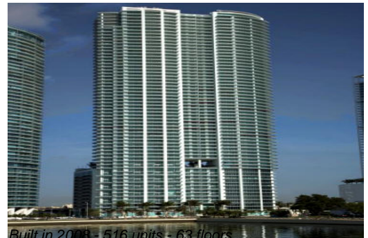
Built in 2008 - 516 units - 63 floors