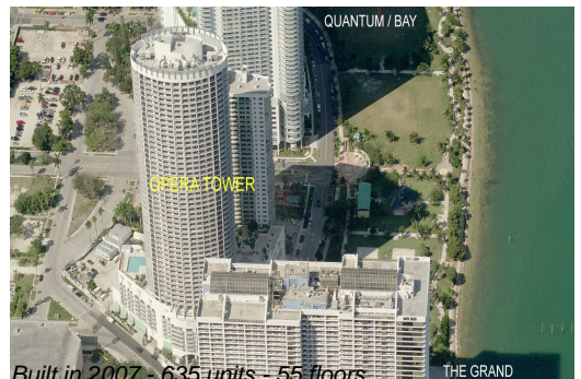
Built in 2007 - 635 units - 55 floors