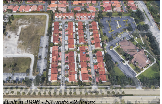
Built in 1996 - 53 units - 2 floors