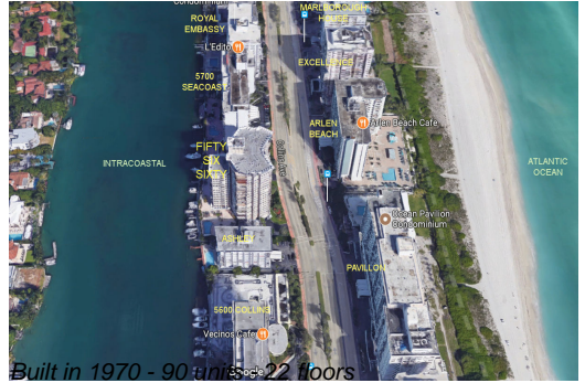
Built in 1970 - 90 units, 22 floors