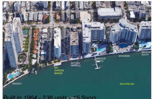
Built in 1964 - 238 units, 45 floors