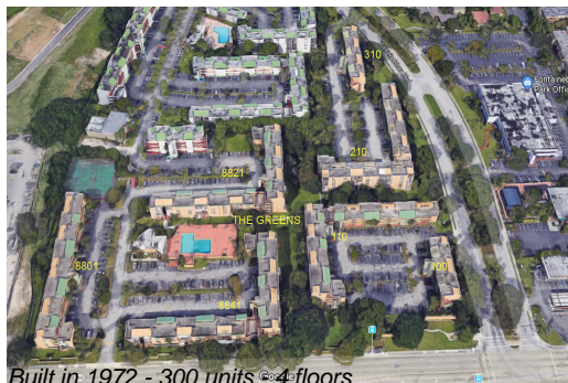
Built in 1972 - 300 units ~4-floors