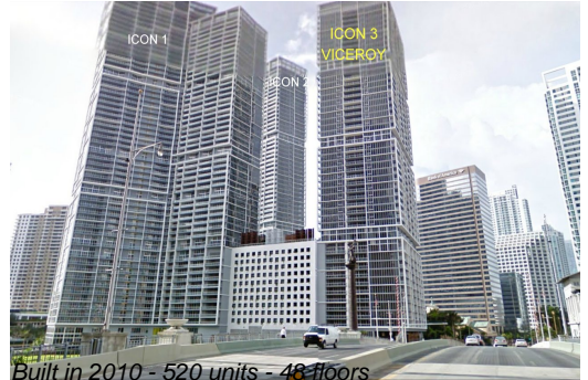
Built in 2010 - 520 units - 48 floors