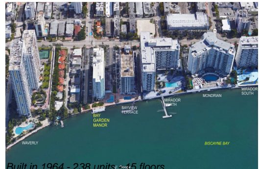
Built in 1964 - 238 units, 45 floors