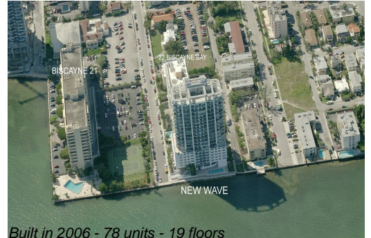
Built in 2006 - 78 units - 19 floors