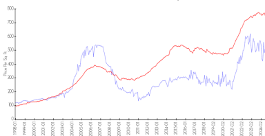
Aventura Beach Club (Ramada Marco Polo) vs Sunny Isles