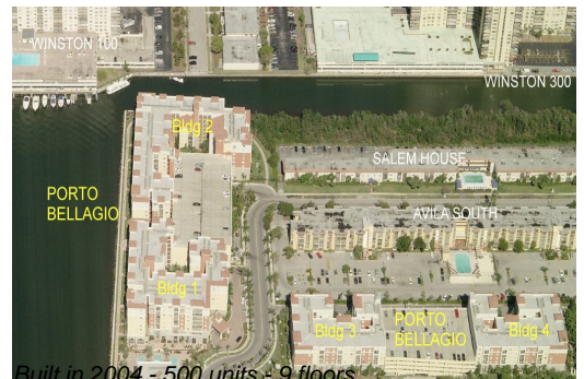
Built in 2004 - 500 units - 9 floors