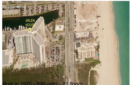
Built in 1975 - 599 units - 21 floors