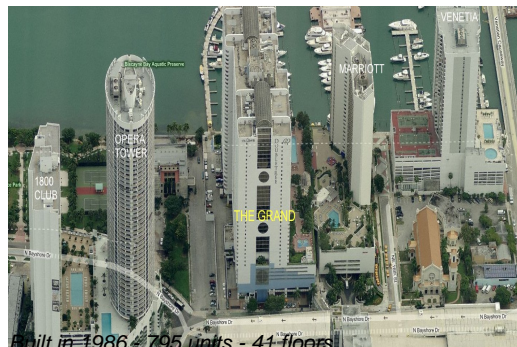
Built in 1986 - 795 units - 41 floors