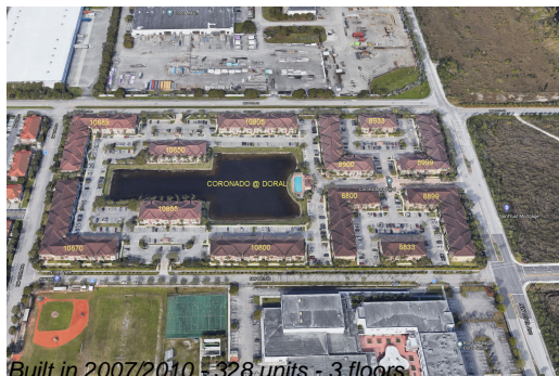
Built in 2007/2010 - 328 units - 3 floors