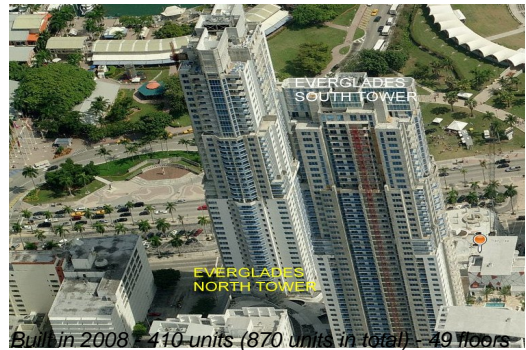
Built in 2008 - 410 units (870 units in total) - 49 floors