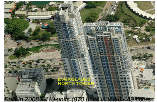
Built in 2008 - 410 units (870 units in total) - 49 floors