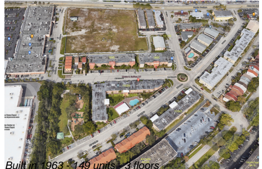
Built in 1963 - 149 units - 3 floors