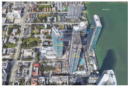
Built in 2018 - 384 units - 44 floors