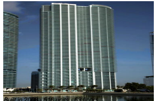
Built in 2008 - 516 units - 63 floors