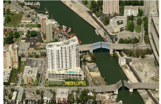
Built in 2004 - 199 units - 20 floors