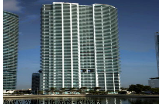
Built in 2008 - 516 units - 63 floors