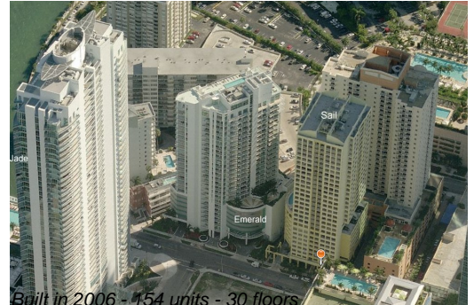
Built in 2006 - 154 units - 30 floors