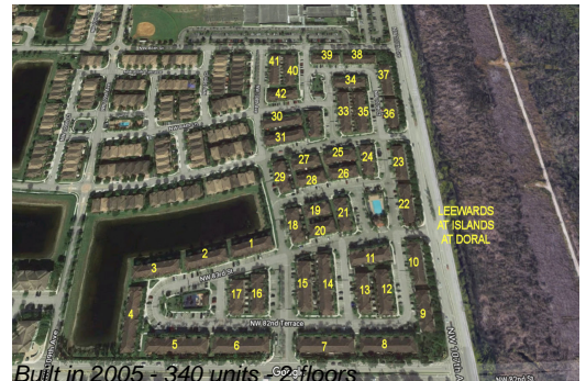
Built in 2005 - 340 units - 2 floors