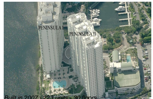
Built in 2007 - 223 units - 30 floors