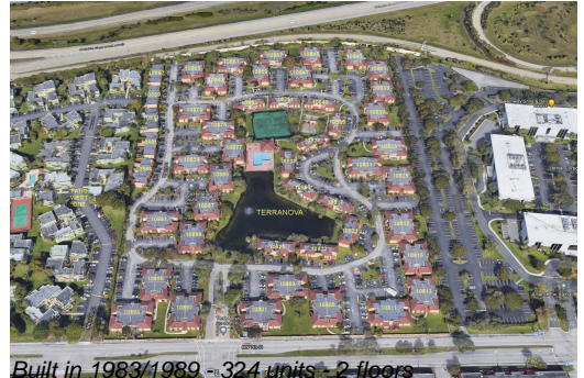
Built in 1983/1989 - 324 units - 2 floors