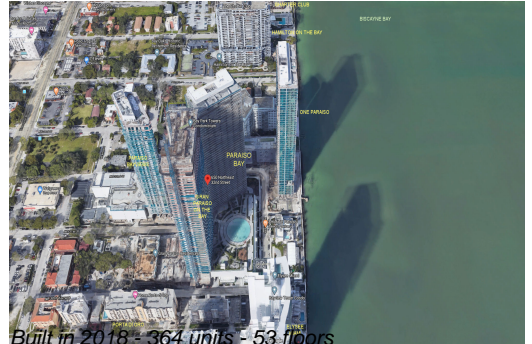
Built in 2018 - 364 units - 53 floors