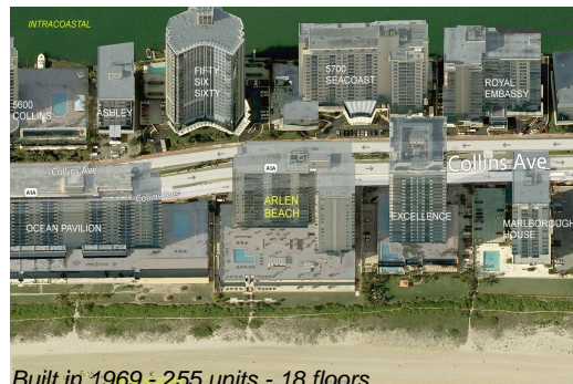
Built in 1969 - 255 units - 18 floors