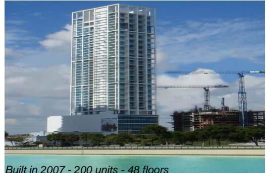
Built in 2007 - 200 units - 48 floors