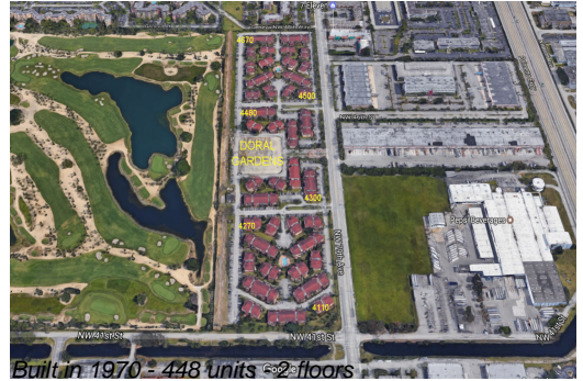
Built in 1970 = 448 units = 2 floors