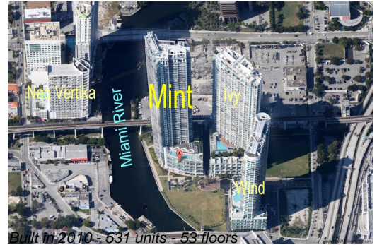
Built in 2010 - 631 units - 53 floors