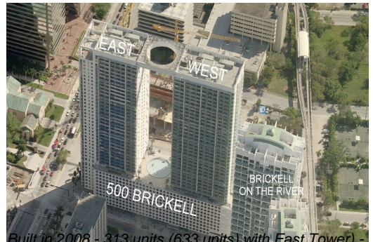
Built in 2008 - 313 units (633 units) with East Tower) - 43 floors