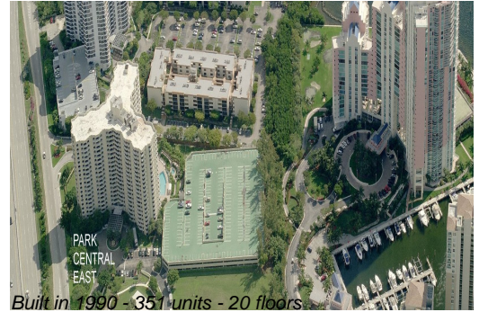
Built in 1990 - 351 units - 20 floors

The above valuated price is a baseline figure that does not take into account any specific renovation, upgrade, split, merge, or deterioration of the unit.