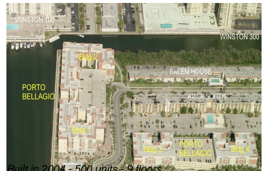
Built in 2004 - 500 units - 9 floors