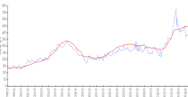
Mystic Pointe Tower 400 vs Aventura