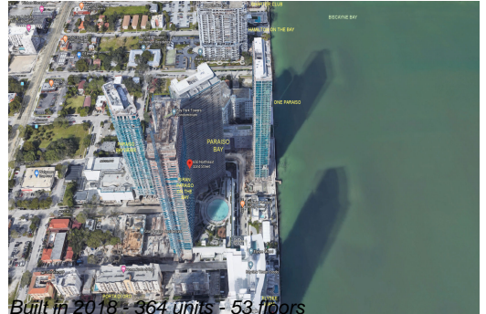
Built in 2018 - 364 units - 53 floors