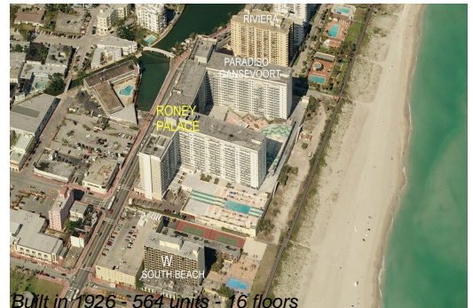
Built in 1926 - 564 units - 16 floors