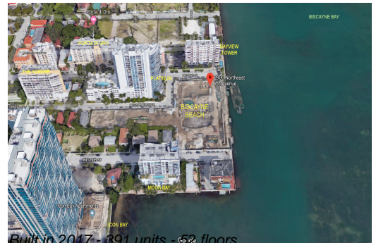
Built in 2017 - 391 units - 52 floors