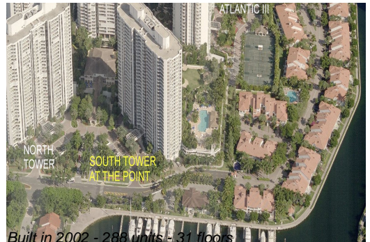
Built in 2002 - 288 units - 31 floors