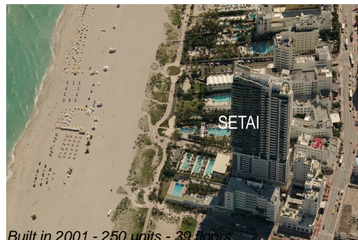
Built in 2001 - 250 units - 39 floors