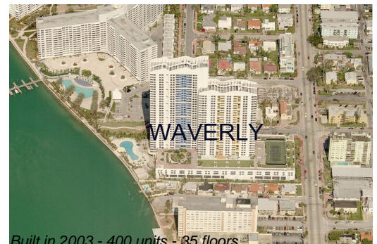
Built in 2003 - 400 units - 35 floors