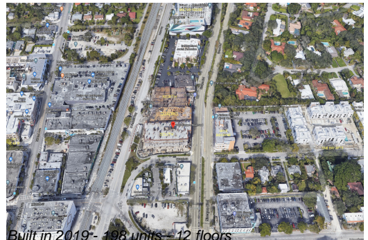
Built in 2019 - 198 units - 12 floors