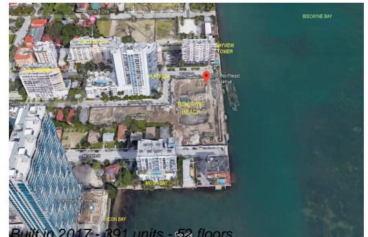
Built in 2017 - 391 units - 52 floors