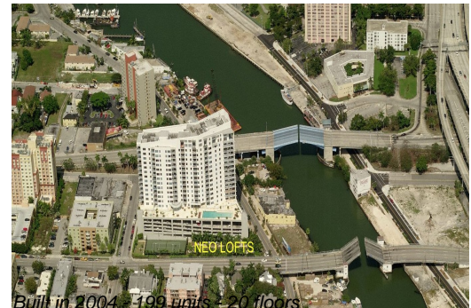
Built in 2004 - 199 units - 20 floors