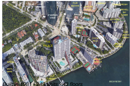
Built in 1981 - 249 units, 44 floors