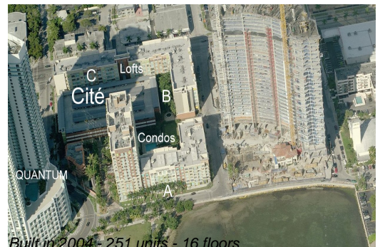
Built in 2004 - 251 units - 16 floors