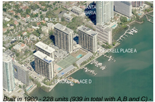
Built in 1980 - 228 units (939 in total with A, B and C) - 23 floors