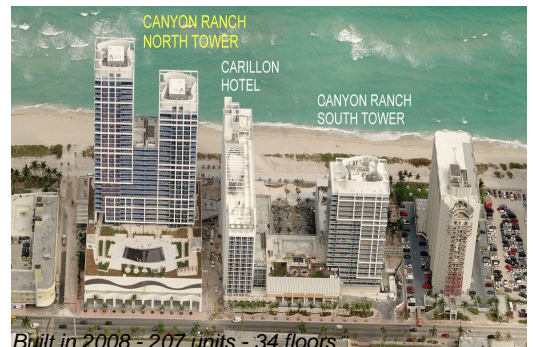
Built in 2008 - 207 units - 34 floors