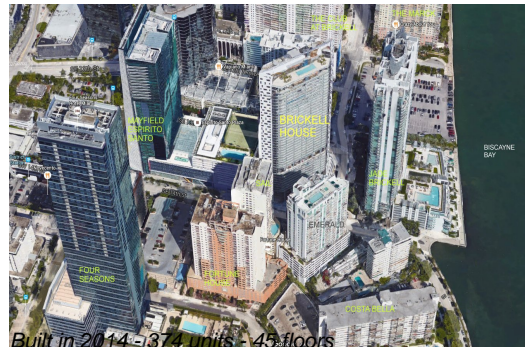
Built in 2014 - 374 units - 45 floors